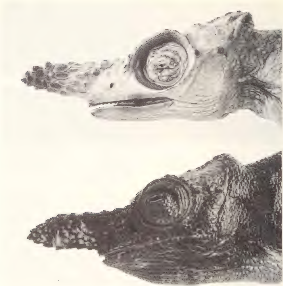
Fig. 5: Lateral view of the head of the males of B. oxyrinum (above ZFMK 46406, below ZMUC 51376).

discoloration of pigments is likely to have occurred. Field notes on the life coloration of the second paratype confirm this view as they read: head: blue, dorsum: green, tail: blue and throat: yellow. Today this preserved specimen shows a general brown colour with lighter shades on the flanks, limbs and tail.